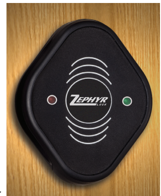
Model 2154 shown installed on wood door