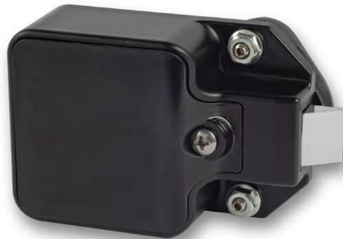
2154 - 2254 (rear view)