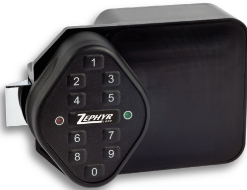
2254 (front view)